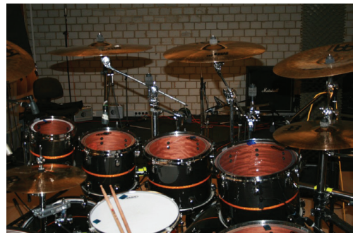
Figure 3: Drum recording room of Blind Guardian's Twilight Hall Studio. 14